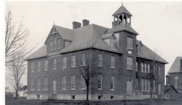
Stirling High School 1911 A portion of the original high school building was retained but it is hard to find any similarities in the old and the new. The school was renamed King George School, building was demolished in 1960. The present Stirling Junior School sits on this site. Visible at the right are St. Paul's United Church and its carriage shed.